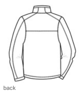
HOW TO MEASURE