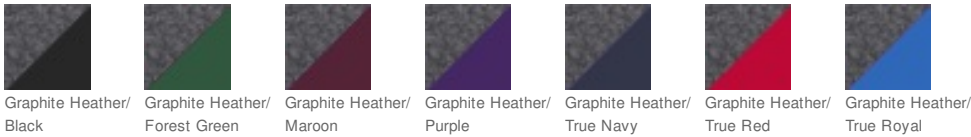
Graphite Heather/Black Graphite Heather/Forest Green Graphite Heather/Maroon Graphite Heather/Purple Graphite Heather/True Navy Graphite Heather/True Red Graphite Heather/True Royal